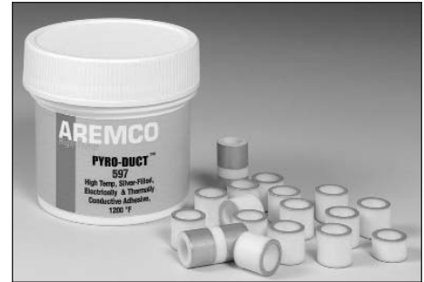
Pyro-Duct™ 597-C metallizes ceramic tubes.

Nickel-Filled, Electrically & Thermally Conductive, One-Part, Adhesive & Coating Systems to 1000 °F