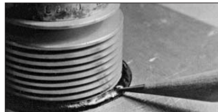
Aremco-Bond™ 805 bonds aluminum heat sink to a power semiconductor device.