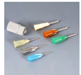
992X Nozzle Adapter and Needles