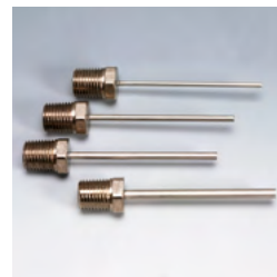
8535, 8540, 8545, 8550 Stainless Steel Needles