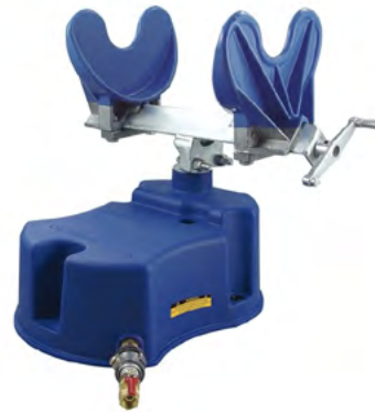
Model 7000 Mixer