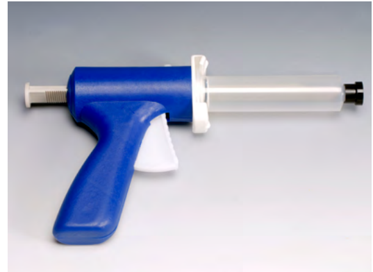
8200 30cc Dispense Gun