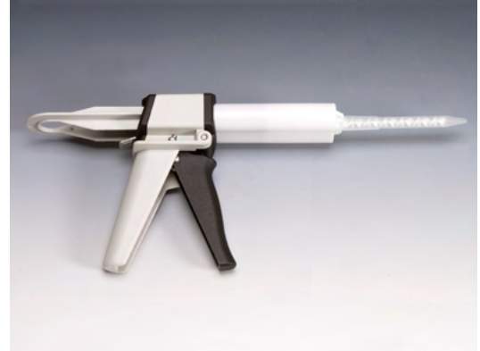
9700 50ml Dispense Gun

Larger cartridge sizes including 75ml, 200ml and 400ml are available upon request.