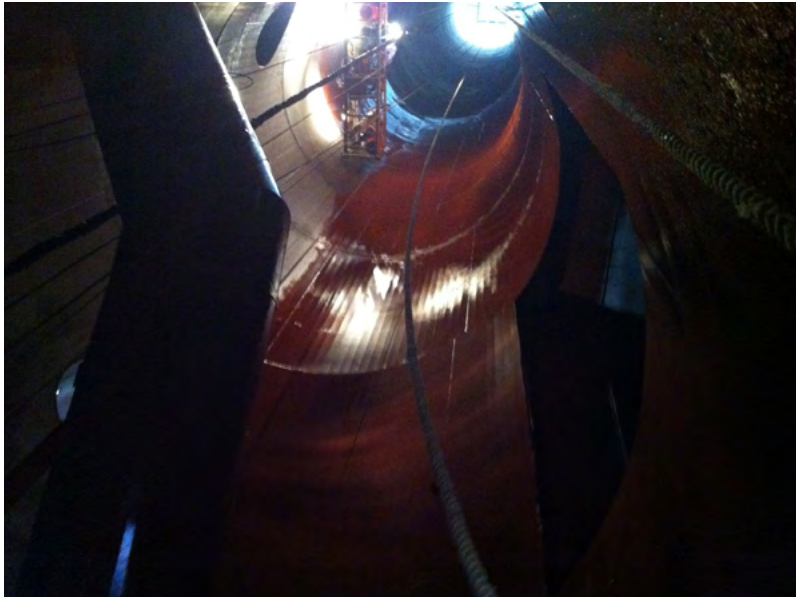
Corr-Paint™ CP2050-LF coats flare stack.