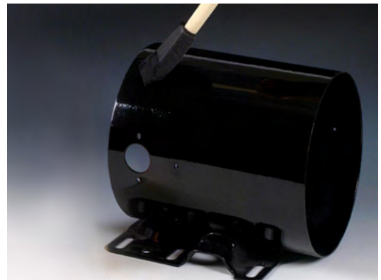
Corr-Paint™ CP2000 coats motor housing.