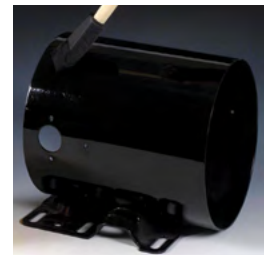
CP2000 seals thermal spray on motor housing.