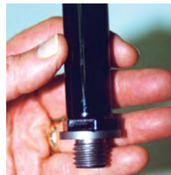
CP2000 seals thermal spray on small heater.