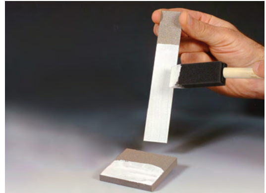
Ceramacoat™ 503-VFG-C-WHT applied to thermal spray substrate.