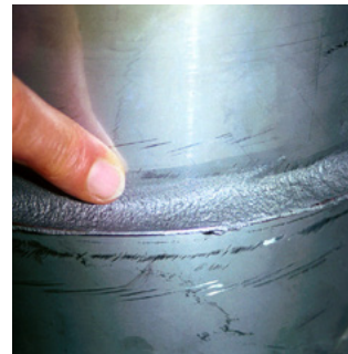
Pyro-Putty® 2400 seals high temp ducting.