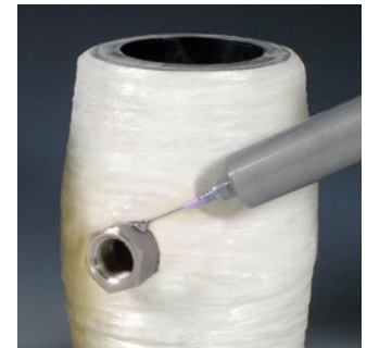
Pyro-Putty® 2400 seals high temp threads.