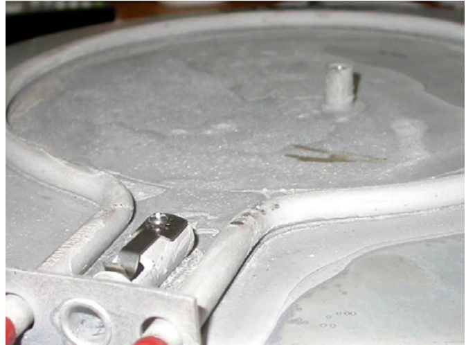
Pyro-Putty® 1000 bonds heater.