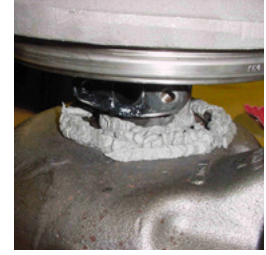
Pyro-Putty® 950 seals turbo.