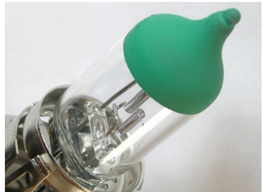
Ceramacoat™ 845-GLT applied to auto headlamp.