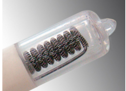
Lamp-Coat™ LC4040-SG applied to IR heater.