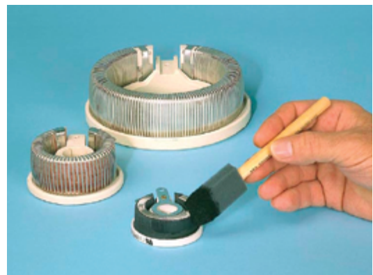
Cerama-Dip™ 538N-BLK coats rheostats.

GC4000 Glass-enamel, gloss-black coating for stainless steel to 1000 °F (538 °C).