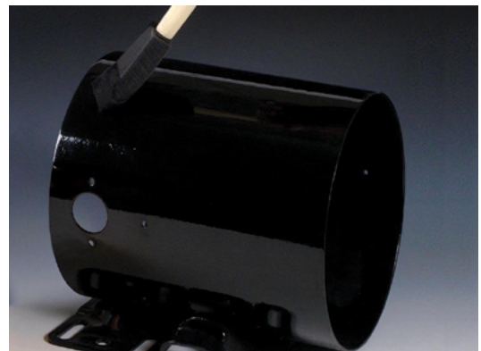
CP2000 seals thermal spray on motor housing.