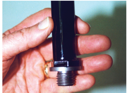
CP2000 seals thermal spray on small heater.