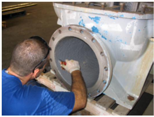
Corr-Paint™ CP2060 coats pump housing.