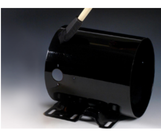
Corr-Paint™ CP2000 coats motor housing.