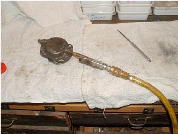
Correct way to disassemble the piston