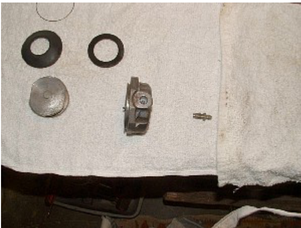
Note the check ball inside the port