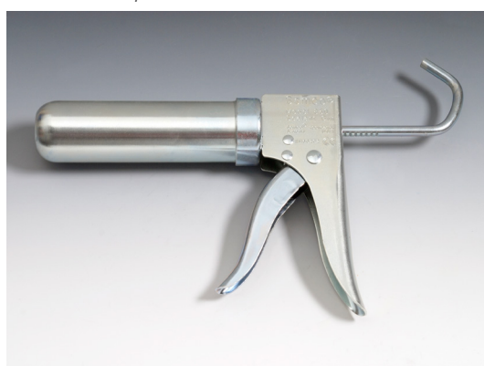
8500 6 oz. Dispense Gun