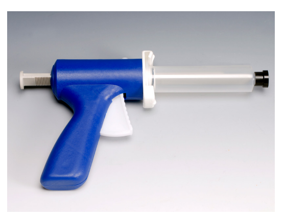
8200 30cc Dispense Gun