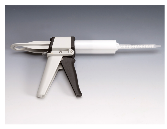
9700 50ml Dispense Gun

Larger cartridge sizes including 75ml, 200ml and 400ml are available upon request.