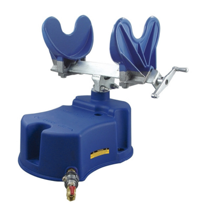
Model 7000 Mixer