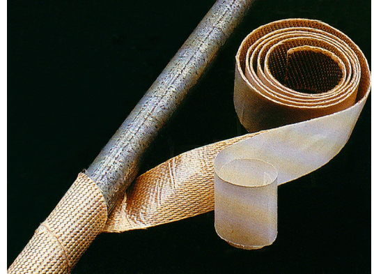
Pyro-Tape™ 682-TB Heat Barrier Tape

The new 682-TB tape is a woven silica fabric tape with temperature resistance as high as 2500 °F used to offer thermal insulation for pipes. The Pyro-Tape™ 682-TB has an adhesive backing which is used to ease wrapping around pipes. The adhesive will burn off at 275 °F, and then the tape is secured to the pipe in intervals with stainless steel wire.