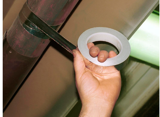
Pyro-Tape™ 682-HR Heat Reflective Tape