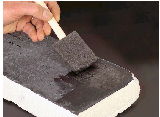
HiE-Coat™ 840-C coats ceramic fiberboard infrared heater.