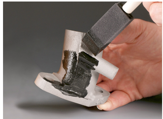
HiE-Coat™ 840-CM coats cast steel part.