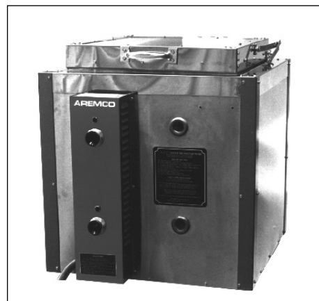
Econo-Heat™ 2931 Top-Loading Furnace. This model has a work area of 17" x 20" x 17" and is capable of 2400° F operation using single phase service, 240 Volts and 40 Amps.