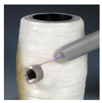
Pyro-Putty® 2400 seals high temp threads.