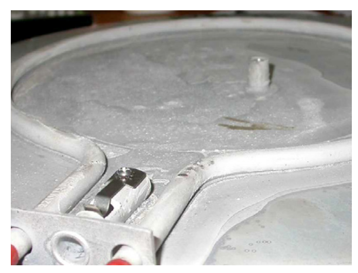
Pyro-Putty® 1000 bonds heater.