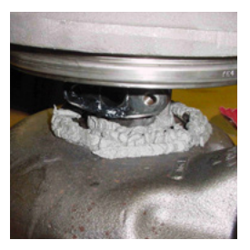
Pyro-Putty® 950 seals turbo.