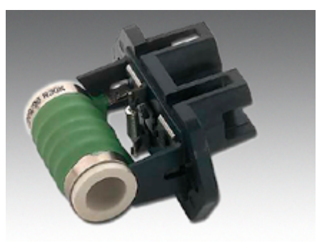
Cerama-Dip<sup>™</sup> 538-N-GRN coats high power resistor.