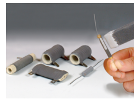
Cerama-Dip<sup>™</sup> 538-N coats high power resistors.