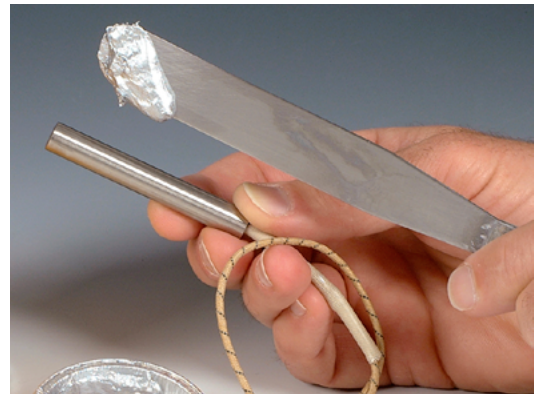
Heat-Away™ 639 coats process heater to improve thermal contact.