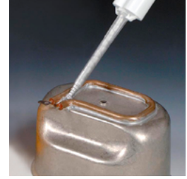
Aremco-Bond™ 568 bonds copper tube heater to reservoir.