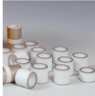
Pyro-Duct™ 597-C metallizes ceramic tubes.