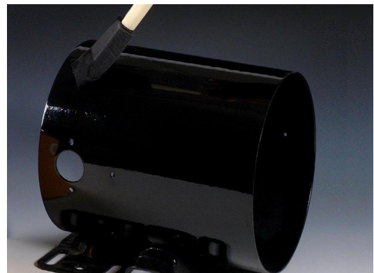
CP2000 seals thermal spray on motor housing.