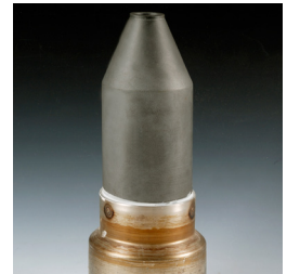
Ceramacast™ 673-N bonds SiC combustion nozzle.

Aremco offers the most expansive range of ceramic-based materials used for the assembly of high temperature, high power electrical devices as well as high temperature fixtures, molds and tooling. These materials, based on aluminum oxide, aluminum nitride, magnesium oxide, silicon dioxide, silicon carbide, zirconium oxide, and zirconium silicate, offer unique properties with respect to operating temperature, thermal conductivity, dielectric and mechanical strength.