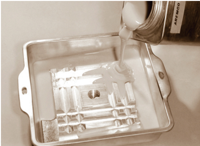
Place the machined master, a duplicate of the finished casting, into a pan, and pour the EZ-Cast™ over the master.