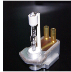
Ceramacast™ 575-N bonds Xenon arc lamp.