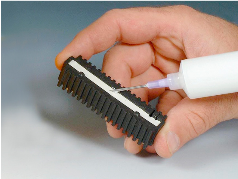
Ceramacast™ 586 pots high power resistor.