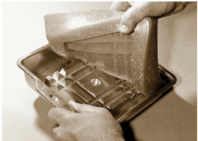
Cure the EZ-Cast™ mold and peel out your finished pliable mold.

Refer to Price List for complete order information.