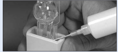
Ceramacast™ 575N pots halogen lamp.