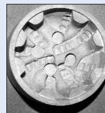
Ceramacast™ 673 used to mold down hole drill bits.