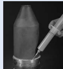
Ceramacast™ 673N bonds SiC combustion nozzle.