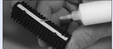
Ceramacast™ 576N pots high power resistor.