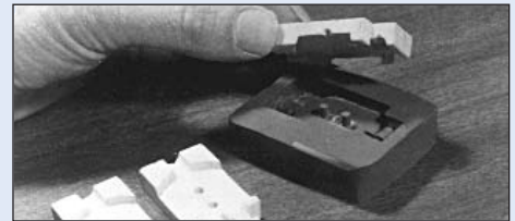
Ceramacast™ 584 casts fine detail welding fixture.