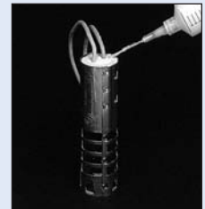
Ceramacast™ 586 used to assemble silicon carbide ignitor.