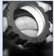
Ceramacast™ 645N insulates support collar.