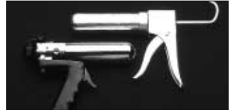
No. 8500 Manual Gun and No. 8510 Pneumatic Gun.