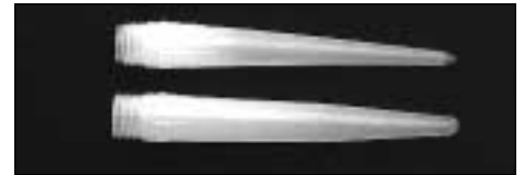
No. 8525, 8530 Plastic Nozzles.