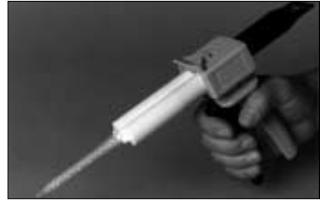
No. 9700 Mechanical Dispense Gun.

Larger cartridge sizes including 75ml, 200ml and 400ml are available upon request.