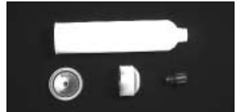
No. 851X 6 oz. Cartridge, Plunger, End Cap, Tip Cap