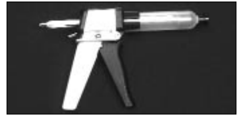
No. 8200 Mechanical Syringe Gun.