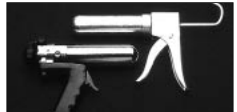
No. 8505 Manual Gun and No. 8510 Pneumatic Gun.