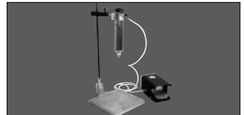
No. 8515 Pneumatic Gun Stand with Foot Switch.