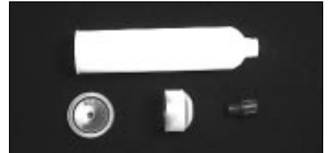
No. 8500 6 oz. Cartridge Kit.