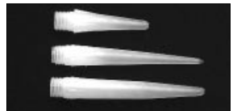
No. 8520, 8525, 8530 Plastic Nozzles.