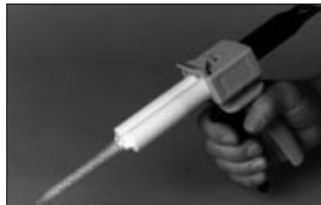
No. 9700 Mechanical Dispense Gun.

Larger cartridge sizes including 75ml, 200ml and 400ml are available upon request.