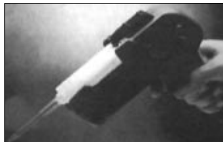
No. 9800 Pneumatic Dispense Gun.

Refer to Price List for complete order information.